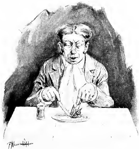
HE EATS A BUTTERFLY